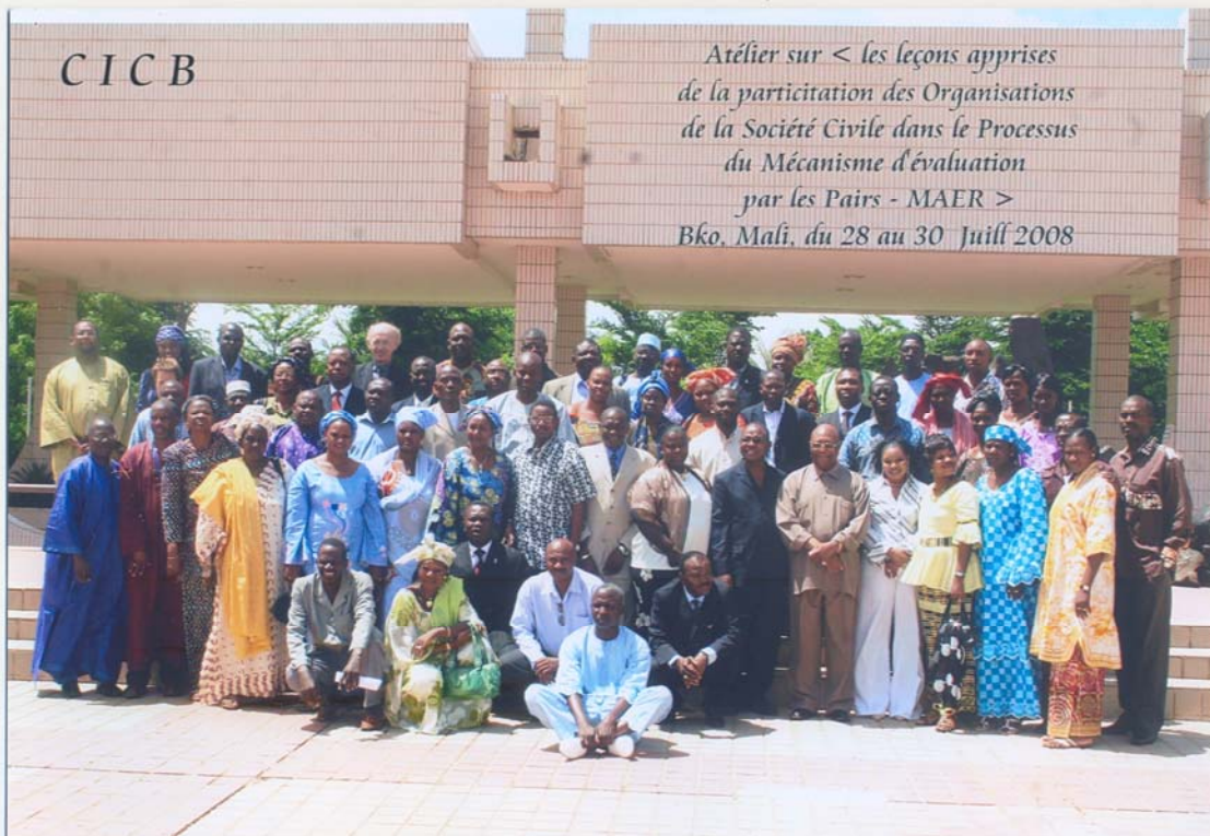
Photo of participants

"Lessons Learned from the Participation of West African Civil Society Organisations in the African Peer Review Mechanism"