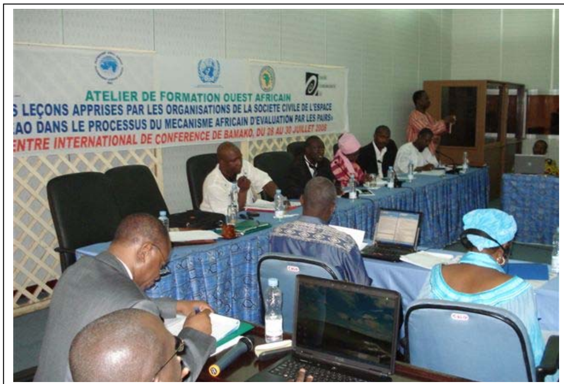
A view of the plenary

committed to being active participants in the APRM process and to working alongside government agencies on the national governing councils.