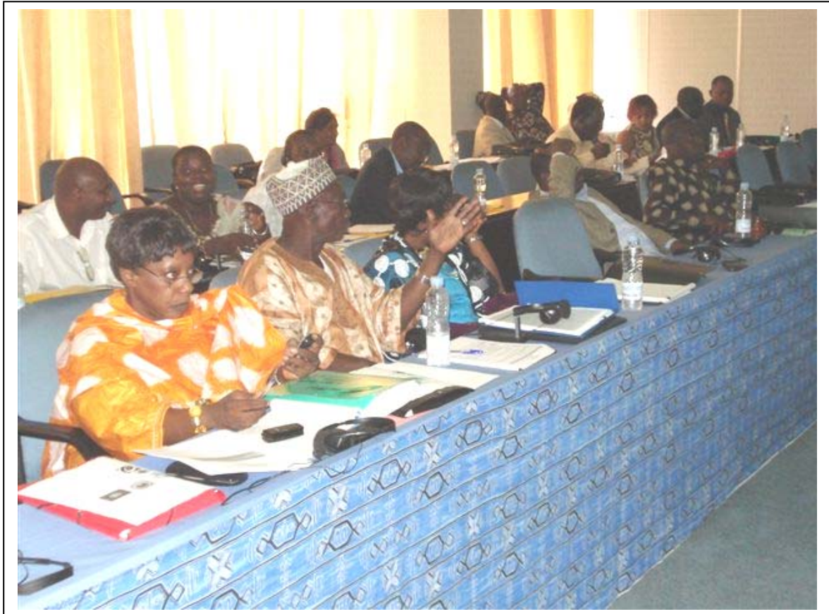
A view of participants

In conclusion , the workshop recommended that the participants' declaration be finalized, promptly translated into English and distributed to participants. Another priority is to finalize the workshop report and make it available to all participants as quickly as possible.