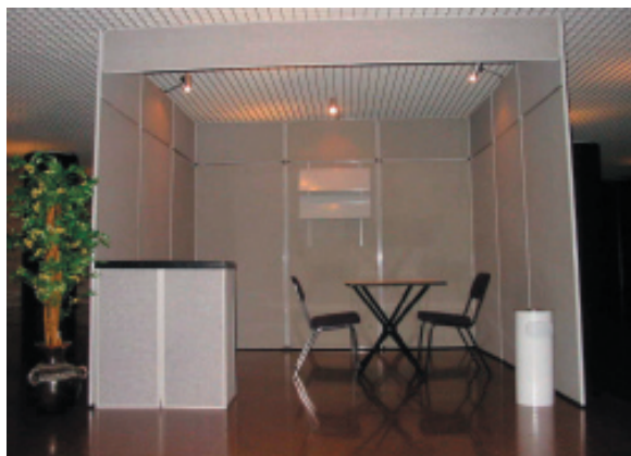
Standard 6 sqm Exhibition Shell Scheme (booth)

ECA has 24-hour security and every effort will be made to ensure the security of exhibits. Nevertheless, the Commission declines responsibility for any loss or damage which may occur, including responsibility for the security of a stand, its exhibits and contents as well as personal property. You are urged to take out your own independent insurance against loss. In our experience, cell phones, briefcases, cameras and handbags are most at risk. Please do not leave them on your stand.