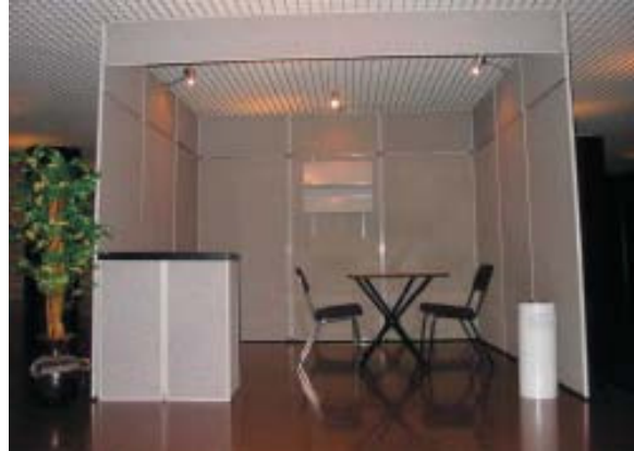
Standard 6 sqm Exhibition Shell Scheme (booth)

Extended size Stands are only available in multiples of standard booth size. Their positioning will be at the discretion of UNCC Exhibition Management