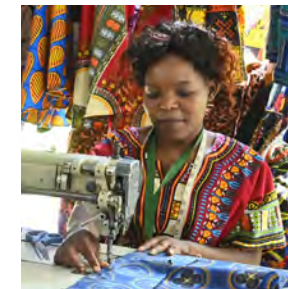
Cross-border trad- ers await benefits of AfCFTA >