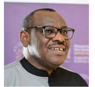
We need a practical, collaborative and regional approach – Gatete >