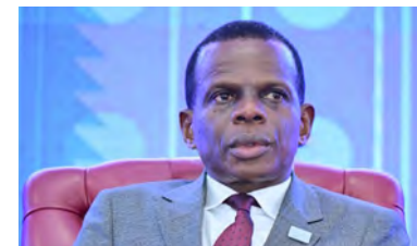
Africa must address the 'paradox of plenty' >