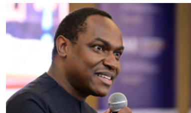
Broadband penetration increases will drive growth >