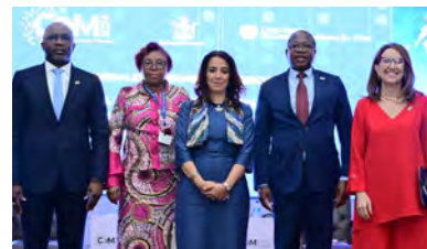
Africa needs a conversation with credit ratings agencies >