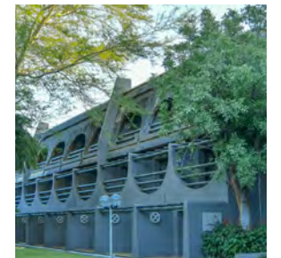
Victoria Falls puts its best foot forward >