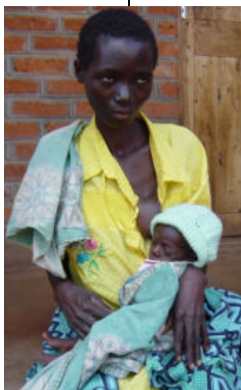
The Human Face of the NVF A Mother and Child, both HIV infected and severely malnourished, at therapeutic feeding centre in Blantyre district of Malawi.

He explained that in the same way that HIV predisposes the body to opportunistic infections and diseases that lead to increasing morbidity and mortality, so too did it render the