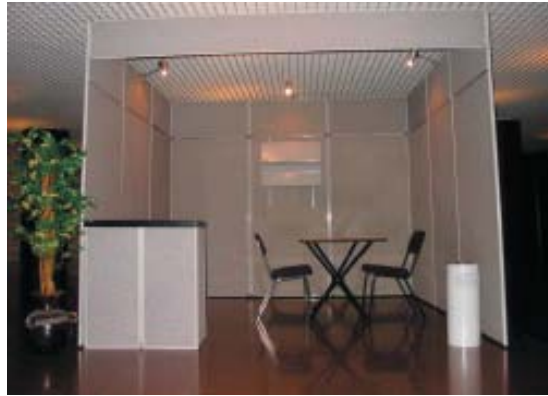
Standard 6 sqm Exhibition Shell Scheme (booth)