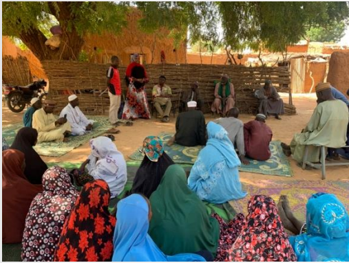
Community entry and engagement Processes. Participatory Planning