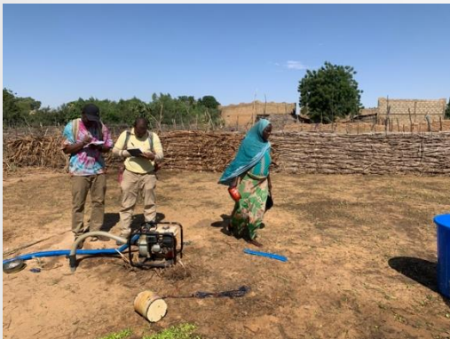
Farm visits-energy for production