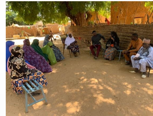
Meeting with Community leaders to discuss land security for the project