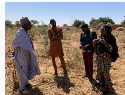
Three (3) hectares secured for group of 40 women farmers for four years