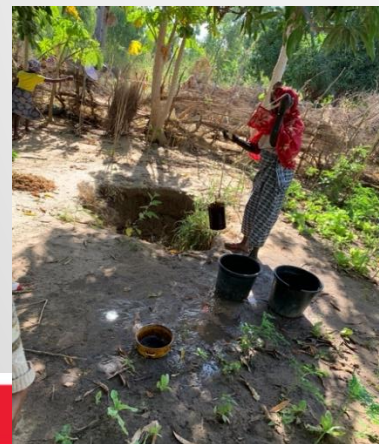
Farm visits-irrigation methods