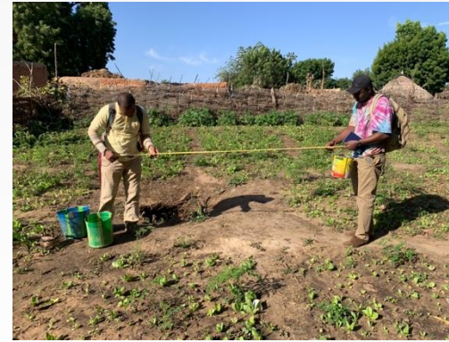
Farm visits-measuring water depth and yield