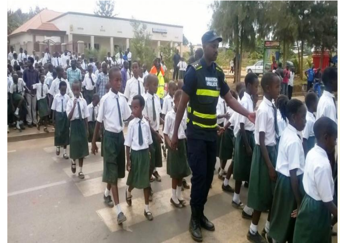
RNP educating school children at a Zebra crossing during Police week