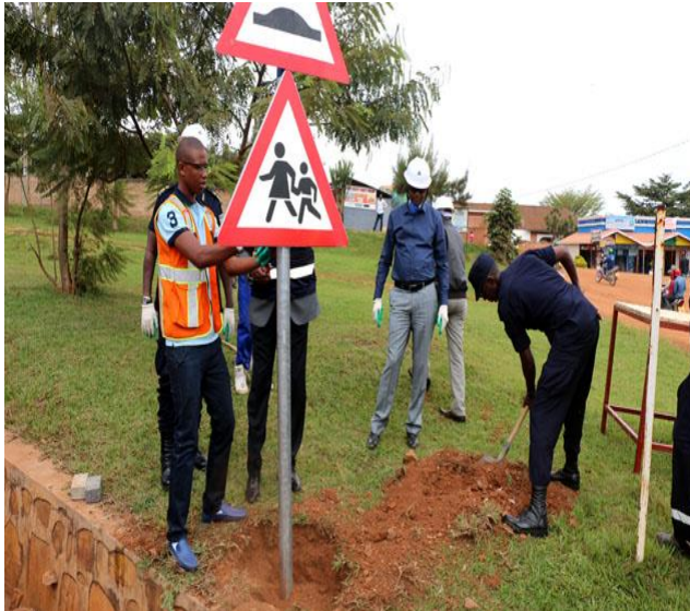
RNP together with RTDA installing Road signs