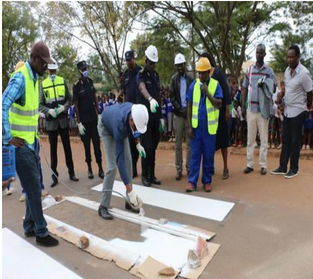
Painting Zebra crossings in School zone