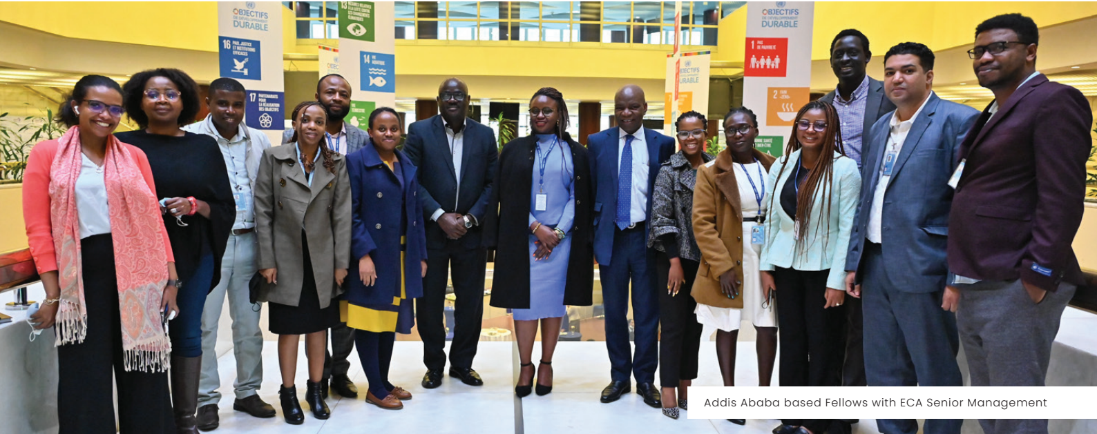
Addis Ababa based Fellows with ECA Senior Management