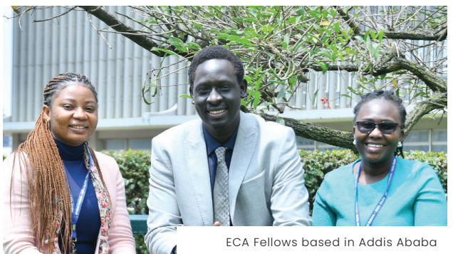
ECA Fellows based in Addis Ababa