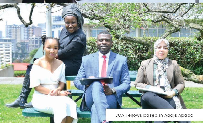
ECA Fellows based in Addis Ababa