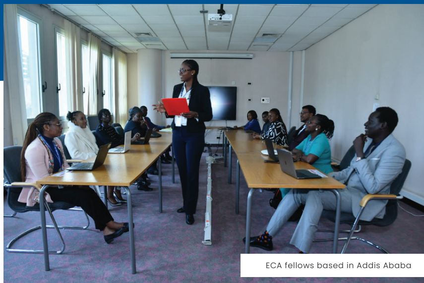
ECA fellows based in Addis Ababa