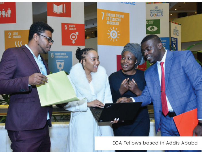
ECA Fellows based in Addis Ababa