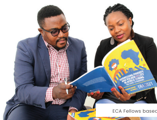
ECA Fellows based in SRO-SA