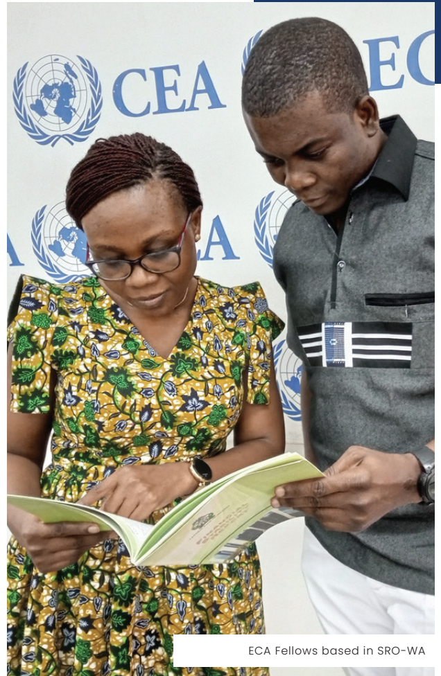
ECA Fellows based in SRO-WA