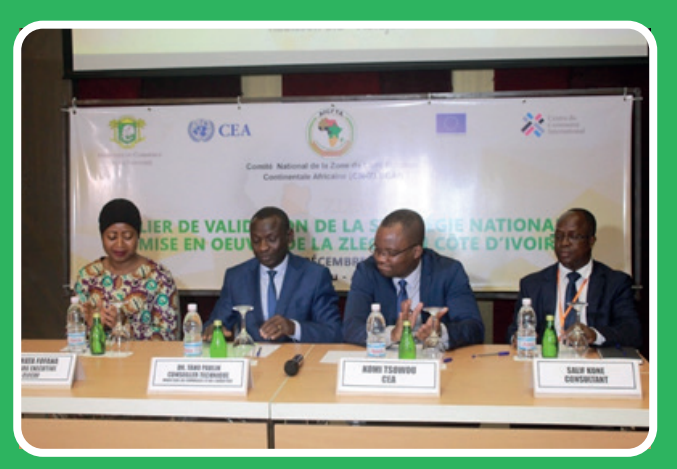
Validation of the AfCFTA national strategy of Côte d'Ivoire