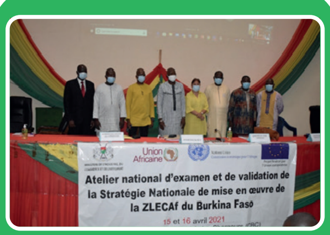
Validation of the AfCFTA national strategy of Burkina Faso