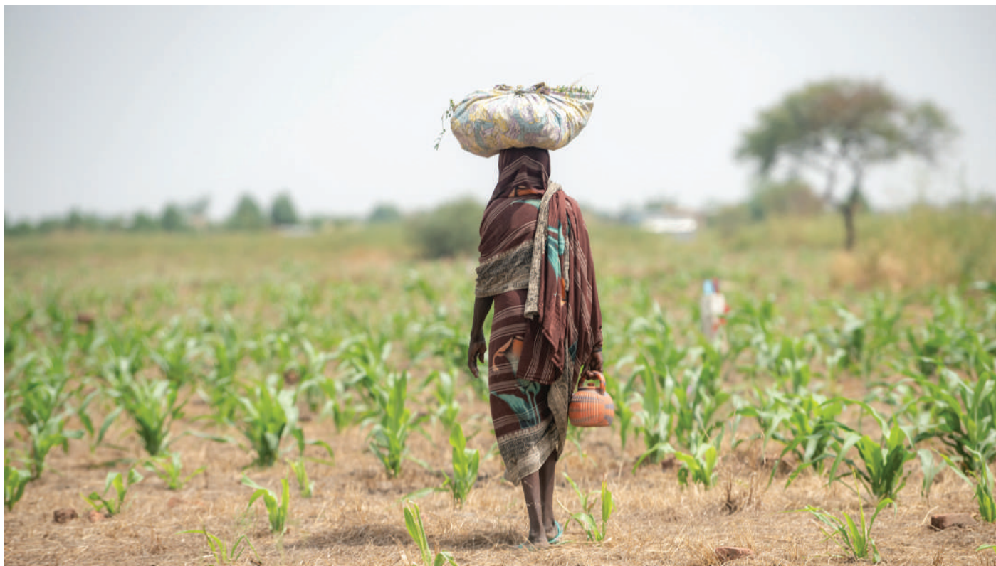
Girl walking in farm field in N'Djamena, Chad