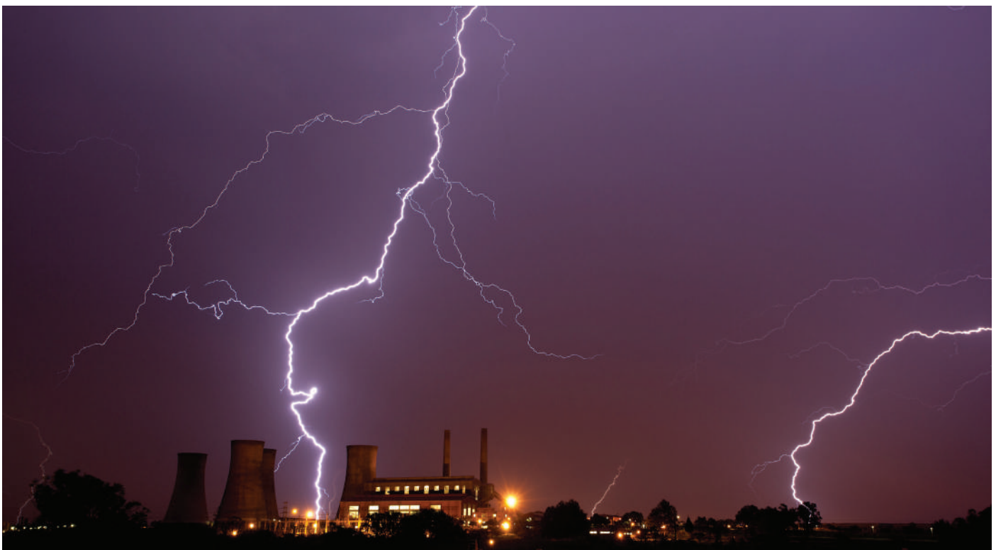
Lightning over power station in Gauteng, South Africa

It is imperative that RCOFs are organised in a timely manner so users can take appropriate action once the consensus is delivered: agricultural practitioners can use the information to work out the optimal time for cropping practices